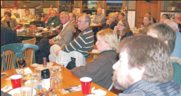
Member Meeting: Sugar Clay Winery, Fremont