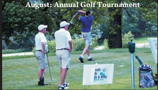
August: Annual Golf Tournament